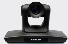
1080p FHD Camera